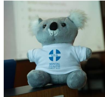
ALGEE - The MHFA Mascot

Almost 2,500 individuals in Chester County have become certified Mental Health First Aiders since the program launched locally in July of 2014. The numbers alone are an indication of the program's success, but the MHFA coordinators are just as committed to keeping local First Aiders engaged, informed and updated. Regular gatherings such as the one planned this month help to make that happen. More information and registration.