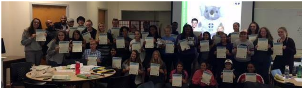
Pictured above, one of the four Mental Health First Aid classes of RAs at West Chester University.

West Chester University begins the new academic year with a little stronger safety net for students who may be struggling with mental health concerns. Last month, 130 Residence Assistants (RAs), paid peer leaders in the residence halls, were certified in Mental Health First Aid (MHFA) , and a new Community Mental Health Clinic opened on campus.